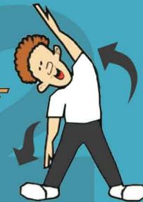
TILTING STAR 2X SLOWLY